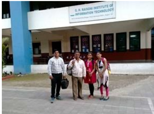
MSBTE TECHNICAL PAPER COMPETITION 2018