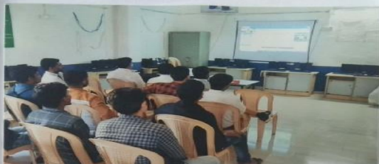
ICT is Management Issues of Laboratory & Workshop Class Program Attended by the staff at P.D.V.B.Kolte, Malkapur