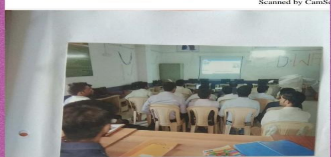
Scanned by CamScanner