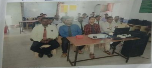
ICT is Management Issues of Laboratory & Workshop Class Attended by the faculty at P.D.V.B.Kolte, Malkapur