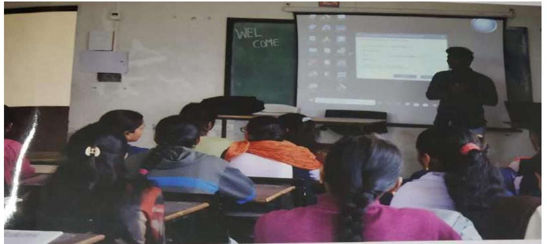
Workshop on IoT